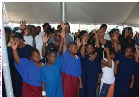
Candidates for baptism in North Bahamas Mission affirming their beliefs by the raising of hands.