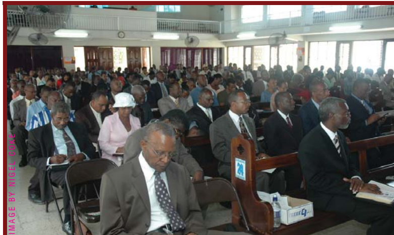
Pastors and Elders in attendance at the meeting