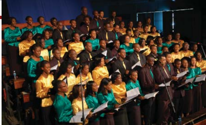
The National Adventist Choir

people's lives when they join the church. It's not just to have a number in the church. We want to have the best citizens, the happiest people. We want our people to be the best neighbours, so church growth for us has an indirect added result of improving the