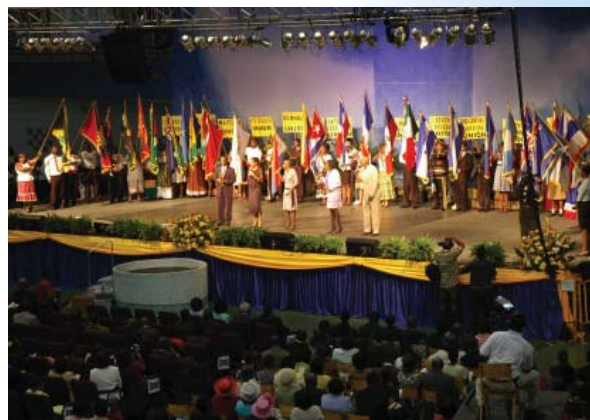
The colourful display and parade of all 15 Unions in the IAD.