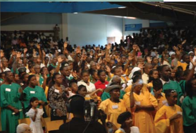
Candidates for baptism affirming their beliefs

communities where these people are," he said.