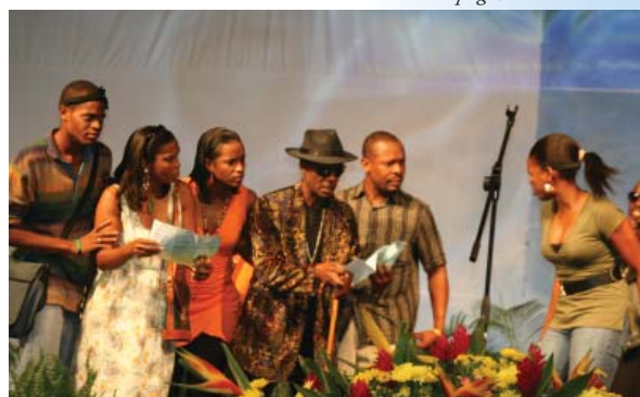
A scene from the Pentecost and More 2008 drama.