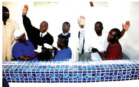
Baptism by Mission Leaders