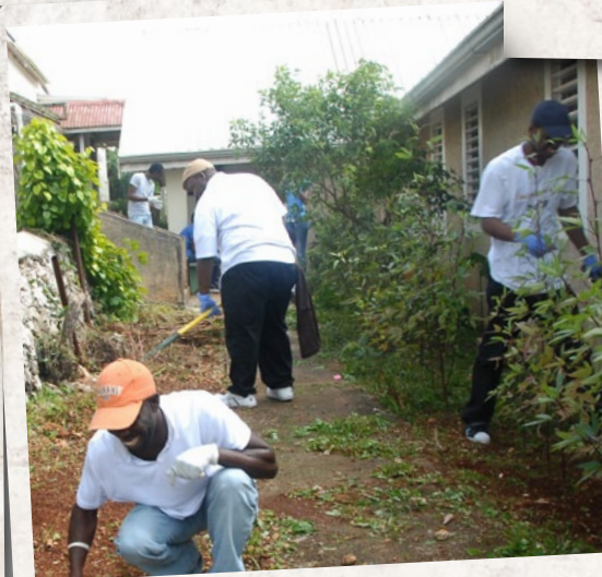
Members of the United Student Movement (USM) of Northern Caribbean University (NCU) participated in a day of personal care for the residents and did general clean-up of the compound at the Curphey Home in South Manchester in April 2011. The students also painted parts of the building